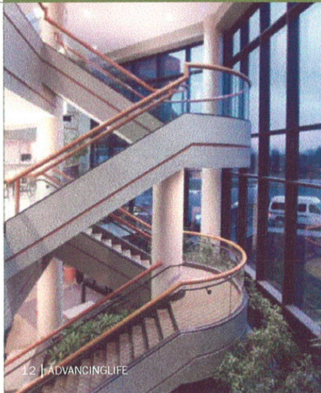
12 | ADVANCINGLIFE