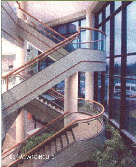
12 | ADVANCINGLIFE