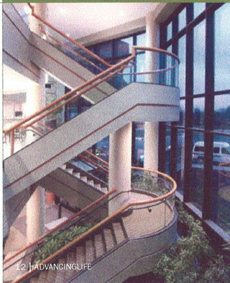
12 | ADVANCINGLIFE