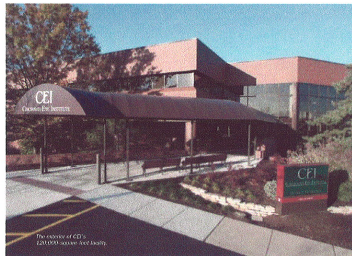
The exterior of CEI's 120,000-square-foot facility.